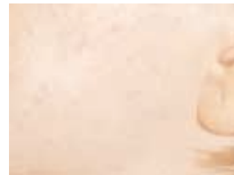
Figure 2—4 Weeks Post-treatment