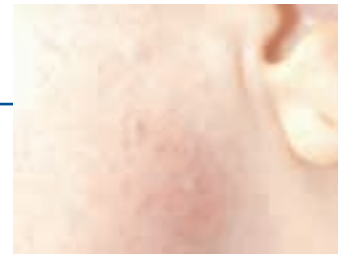
Figure 1—Immediate Post-treatment